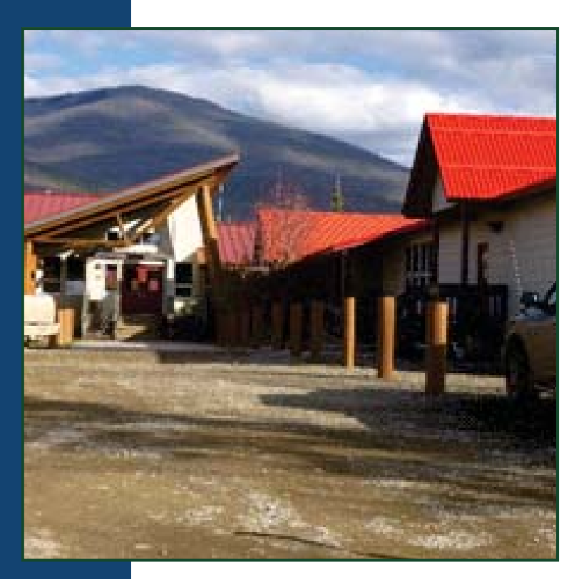
Aatse Davie School with new addition on right

A central focus of the Recreation Center is a state of the art fireplace in the entrance way. The Recreation Center will house a kitchen, computer room, work-