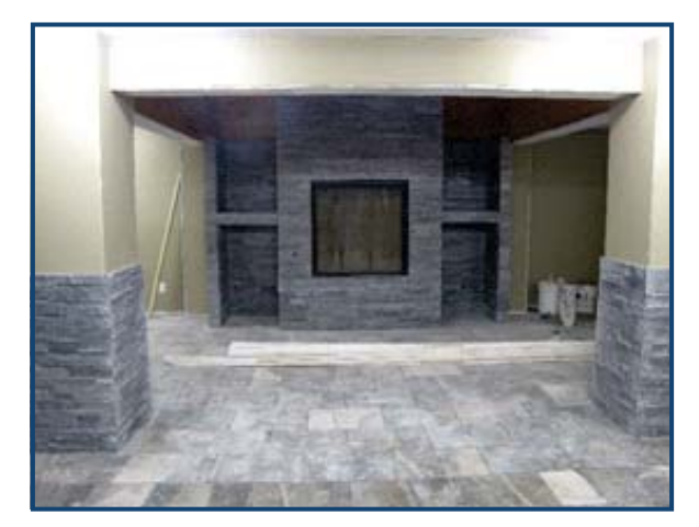
Central fireplace in Recreation Centre

out room, large bingo hall, and a recording studio.